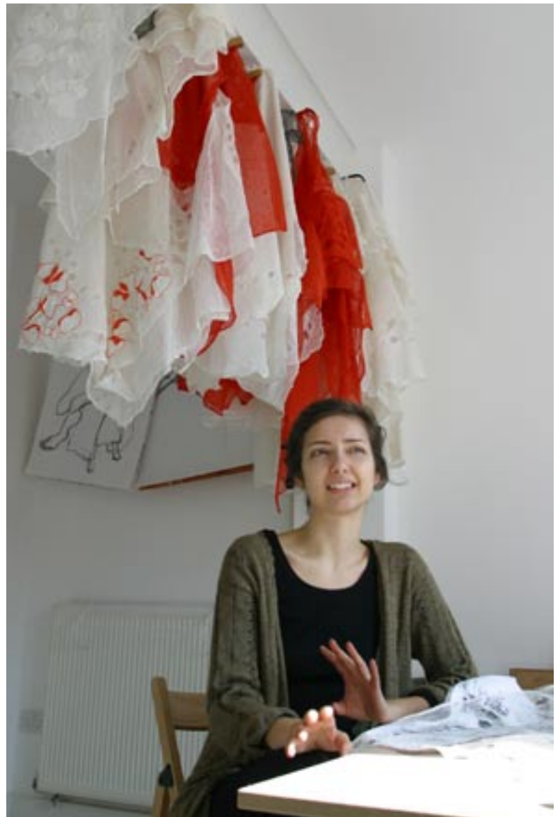
Fashion designer, Forest Garden Mews